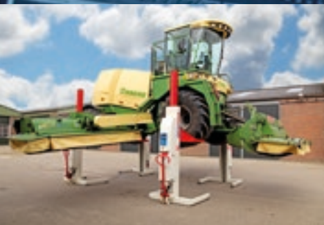
MOBILE COLUMN LIFT

STERIL SUPERIOR SOLUTIONS BY QUALITY PEOPLE